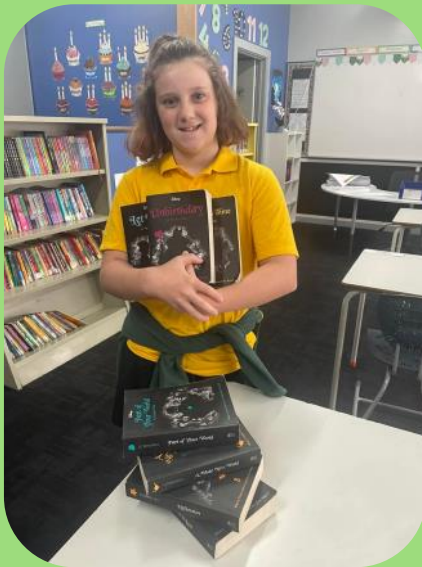
Scarlett's generous donation of a set of books for our classrooms